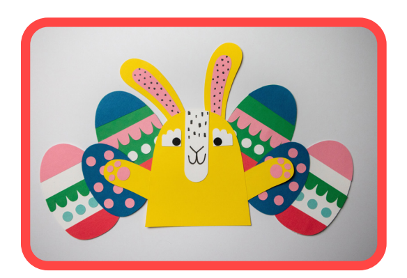
6) How you arrange them is up to you, but start gluing the eggs at the front, before layering the others behind