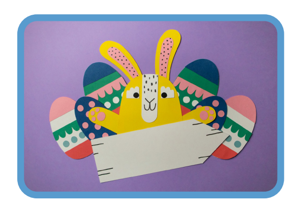
7) Finally, glue the sign on the front, and write what you want on it. You can now stick it inside your window, with a bit of sticky-tape