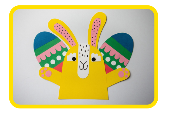
4) Arrange the eggs behind the bunny, and glue them down