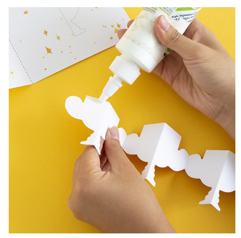
5. Apply glue on the back half of the 2 trophies on the end.

4. Take the trophies cut out and fold accordion style on the dash lines.