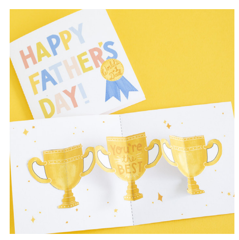
6. Attach the trophies onto the inside of the card marked 'Glue'. Decorate and write a message to make it your own!