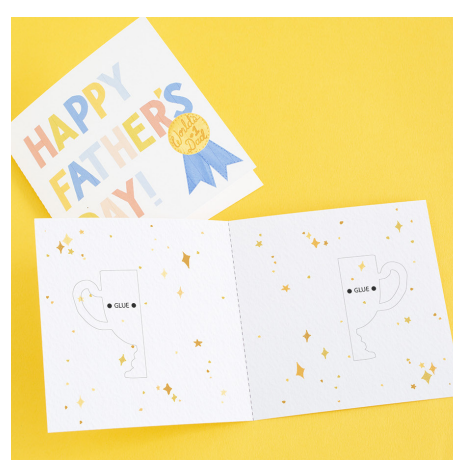
3. Fold page 3 in half. This is the front of the card. Then fold page 4 in half. This is the inside of the card.

2. Cut out the front of the card, the inside of the card and the trophies.