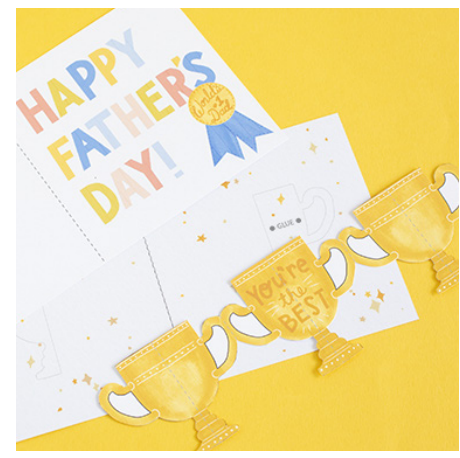
1. Print out pages 3, 4 and 5.

2. Cut out the front of the card, the inside of the card and the trophies.