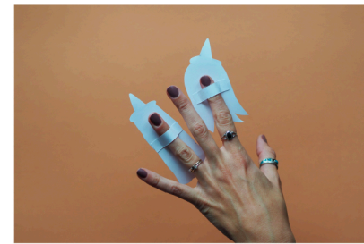
STEP 7 / WHEN THE GLUE IS DRIED PUT ON THE PUPPETS ON YOUR FINGERS