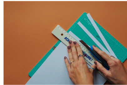
STEP 2 / CUT PAPER STRIPS