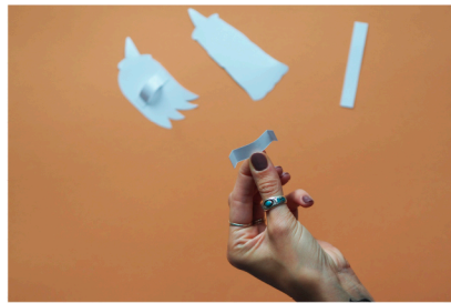
STEP 4 / FOLD STRIPS ON BOTH SIDES AS SHOWN