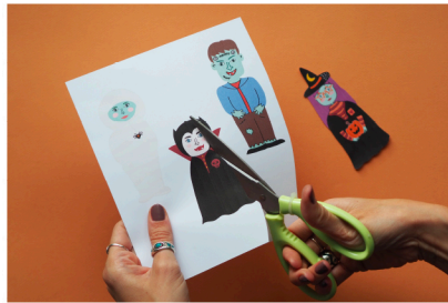
STEP 2 / CUT AROUND THE ILLUSTRATIONS