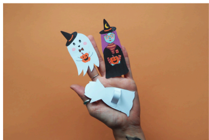
STEP 8 / YOUR PUPPETS ARE READY !