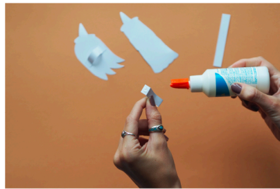
STEP 5 / PUT GLUE ON BOTH ENDS