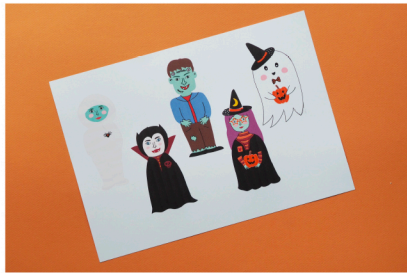
STEP 1 / PRINT THE DESIGNS WITH YOUR HP PRINTER