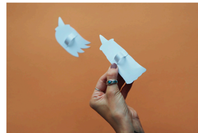
STEP 6 / STICK THE STRIPS BEHIND THE PUPPETS IN ORDER TO MAKE A RING LARGE ENOUGH TO LET YOUR FINGERS GO THROUGH